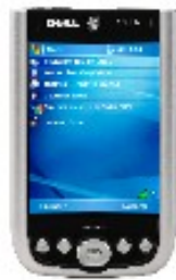
Figure 1: Dell Axim X51

In the past year, via funding from the U.S. Department of Education, researchers at the Harvard Graduate School of Education have developed an augmented reality simulation designed to teach math and science literacy skills to middle school students, with help from colleagues at the University of Wisconsin at Madison and the Teacher Education Program at MIT ( http://isites.harvard.edu/icb/icb.do?keyword=harp ). This immersive collaborative simulation is played on a Dell Axim X51 handheld computer and uses Global Positioning System (GPS) technology (see figures 1 & 2) to correlate the students' real world location to their virtual location in the simulation's digital world.